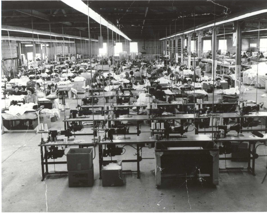
Above: The production floor of the Manti parachute plant. Copy in author's possession. Below: Women workers at the parachute factory. Copy in author's possession. Originals in Don Norton's possession.