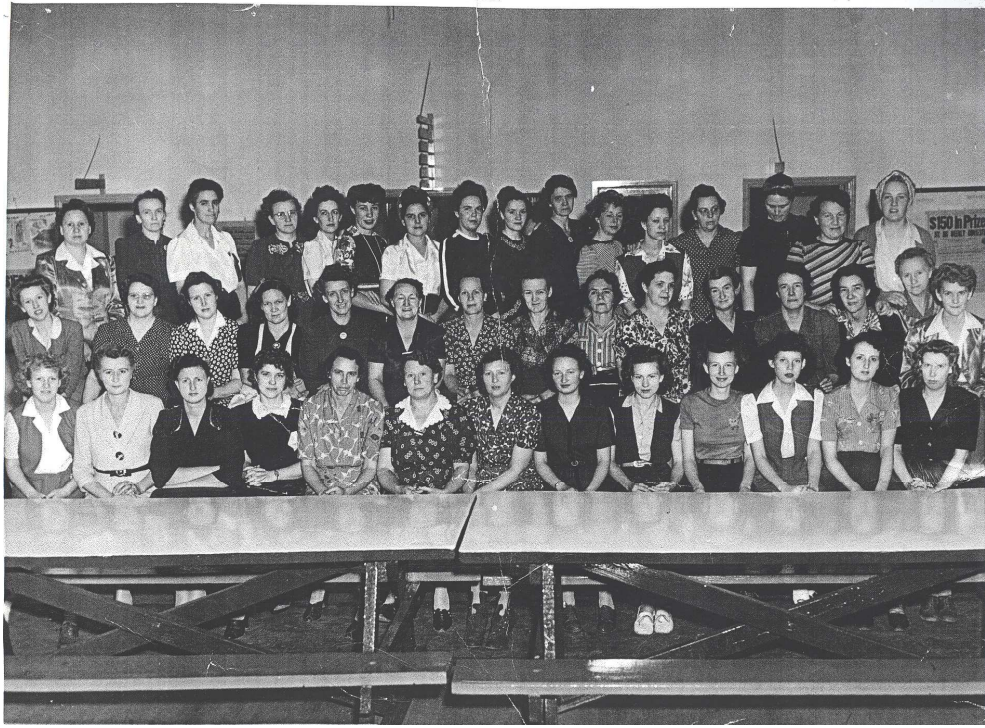
Above: Women workers at the parachute factory. Copy in author's possession. Below: Independent parachute factory workers. Copy in author's possession. Originals in Don Norton's possession.