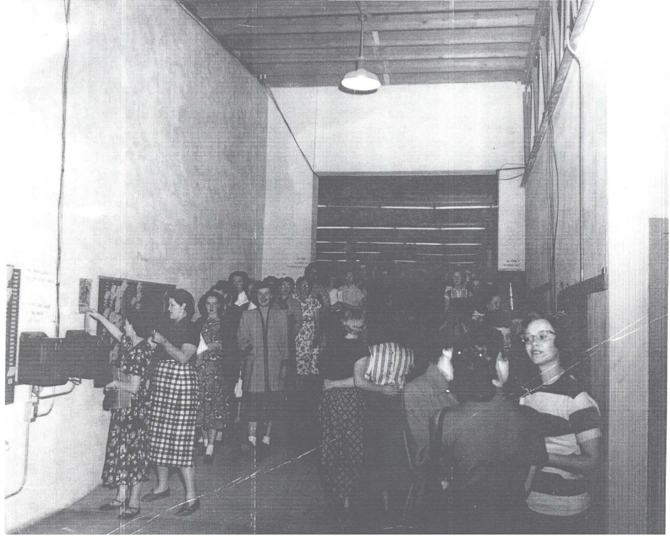
Above and Below: Miscellaneous pictures of women at work in the Manti parachute plant.